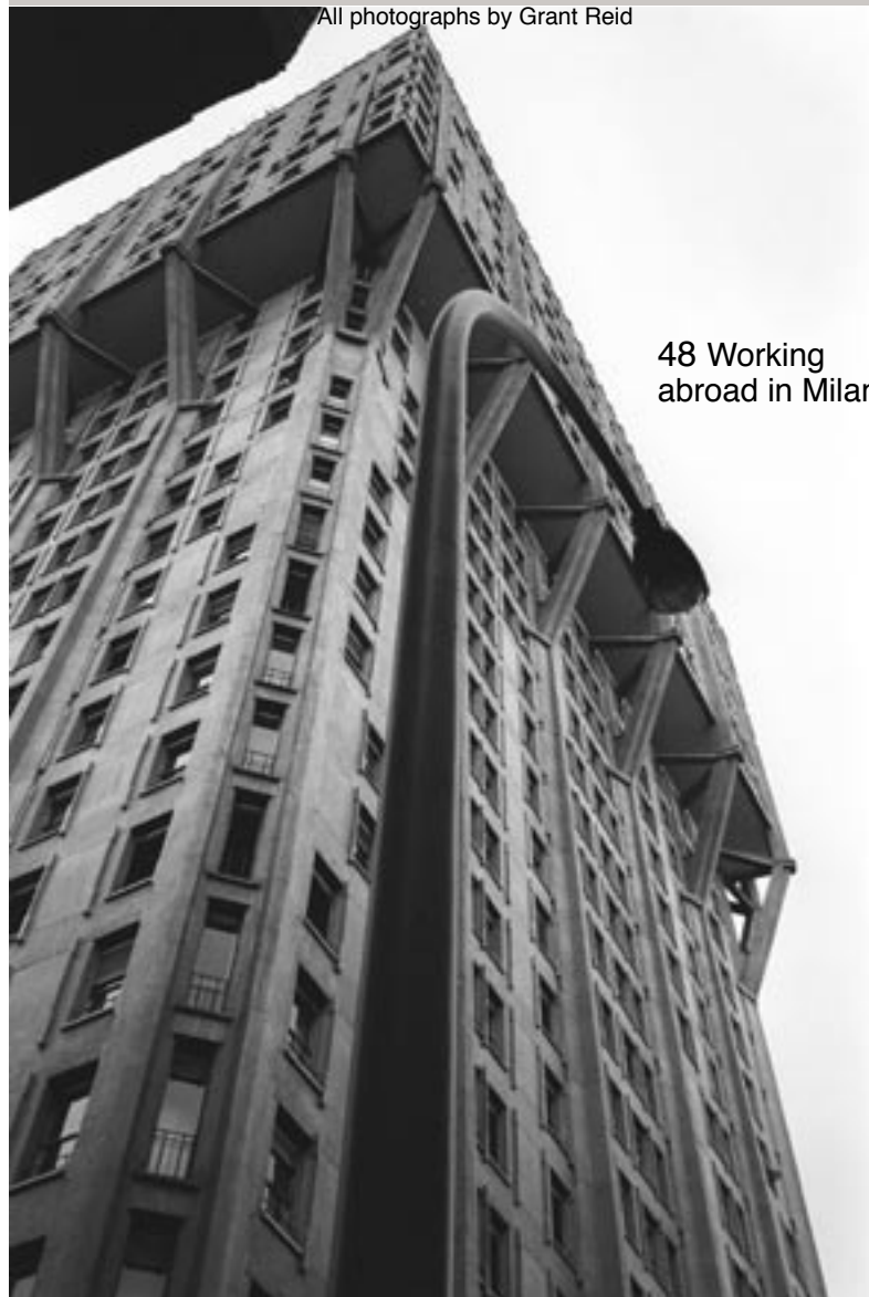
48 Working abroad in Milan