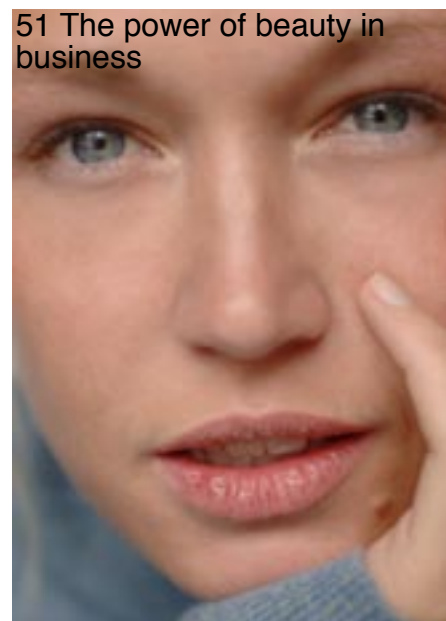
51 The power of beauty in business